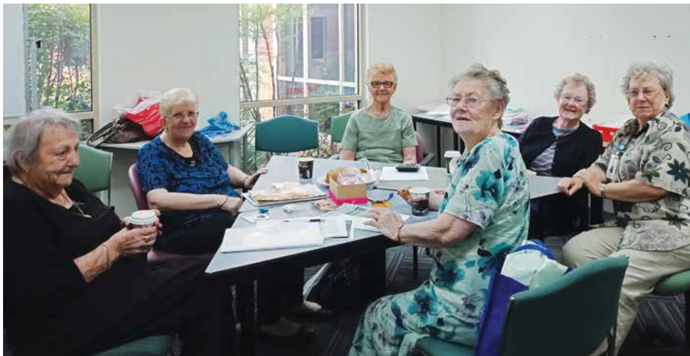
Knitting Guild Volunteers