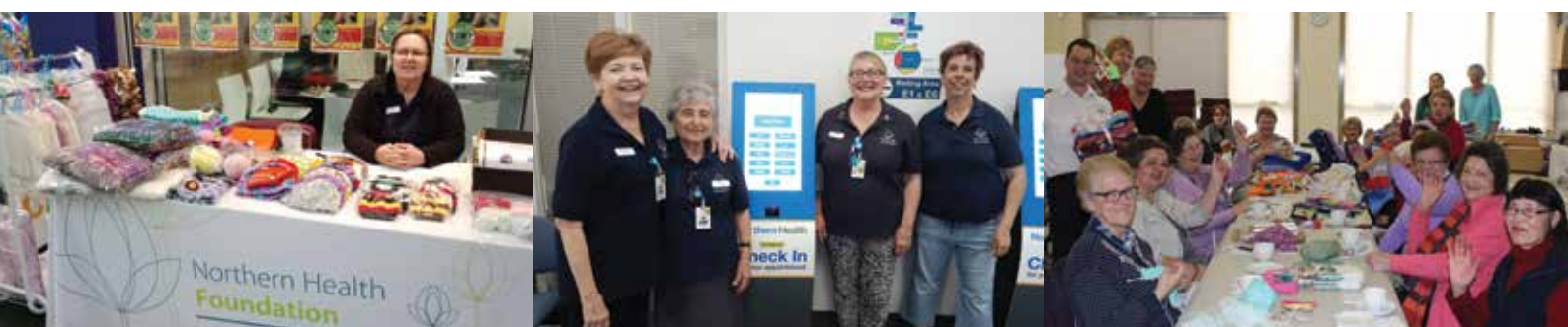
Pictured: Northern Health Volunteers proudly supporting patient care & support and fundraising.