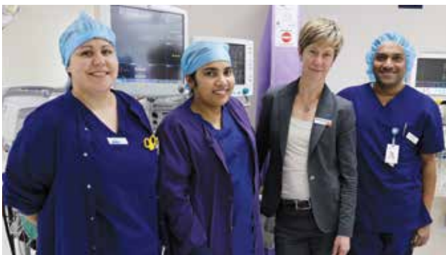
Ear, Nose & Throat (ENT) Surgery Department

The grant has allowed the department to purchase a mastoid drill, a piece of surgical equipment crucial to performing very complex ear surgery.