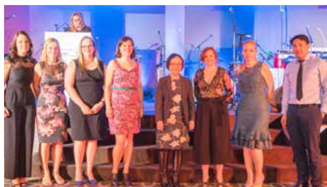
Northern Health Paediatric Team

Northern Health Foundation would like to thank our major sponsors for their support including: