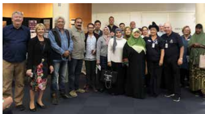
Pictured, Employment Pathways Students, Melbourne Polytechnic and Northern Health Foundation Representatives.

"The support they have shown for their local hospital is a reflection of the community spirit that is ever present here in the north."