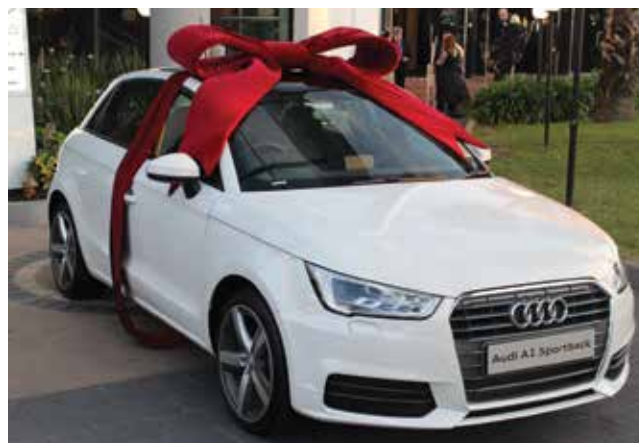
2018 Major Raffle Prize an Audi A1